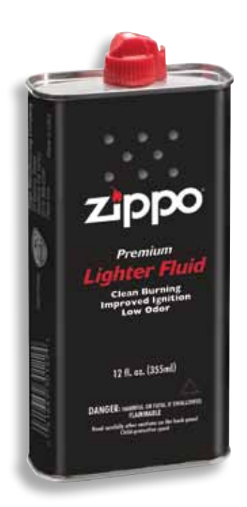
3165EX Lighter Fluid 12 oz. Shipping carton of 96.

Wick Individually carded, punched for pegboard use. Packed 24 Cards per counter display box. 24 boxes per shipping carton.