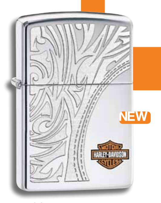
28825 High Polish Chrome Color Image / Lustre