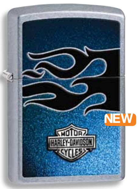
28822 Street Chrome Color Image