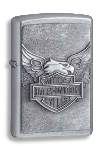
20230 Street Chrome Emblem Attached