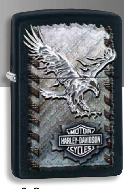
Black Matte Color Image