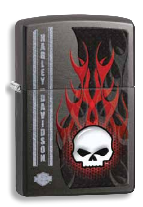
Gray Dusk Color Image / Laser Engrave