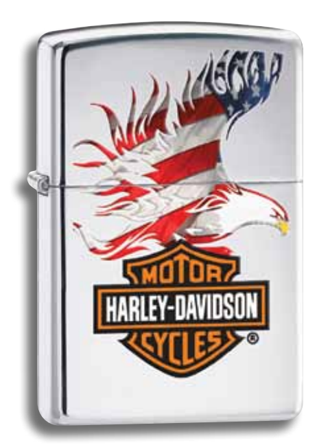
28082 High Polish Chrome Color Image