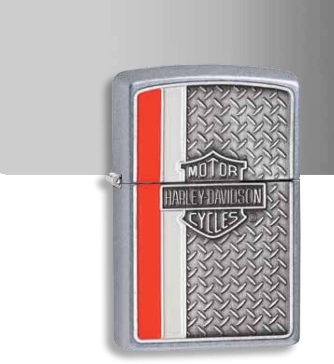
28732 Street Chrome Emblem Attached