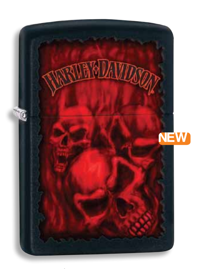
28826 Black Matte Color Image