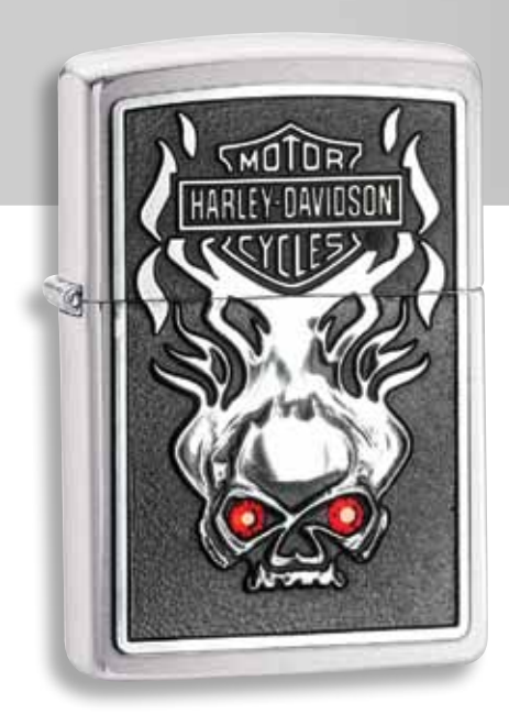
Brushed Chrome Emblem Attached