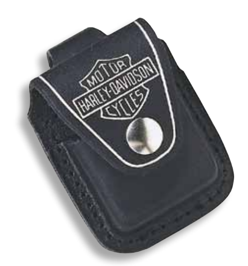
HDPBK H-D® Lighter Pouch w/ Loop - Black