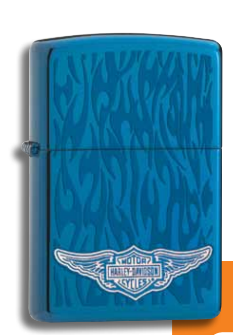
28687 Sapphire Color Image