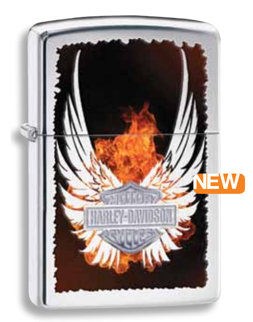
28824 High Polish Chrome Color Image