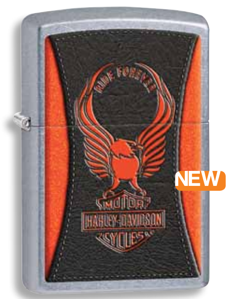
28823 Street Chrome Color Image