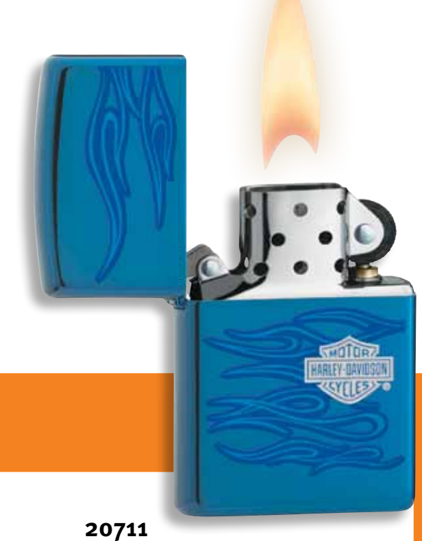
Sapphire Color Image