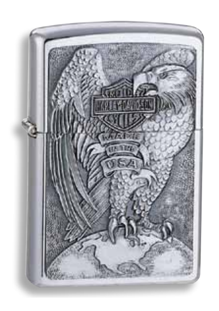
200HD.H231 Brushed Chrome Emblem Attached