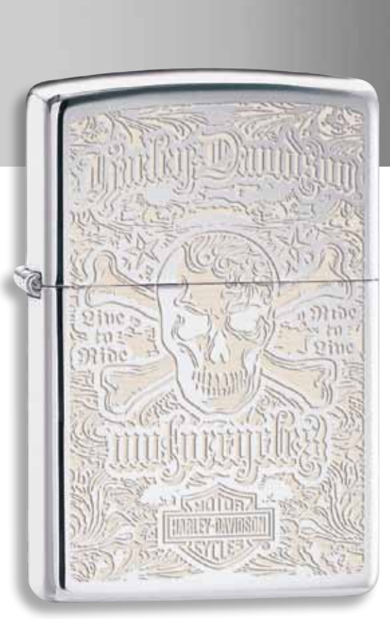
28229 High Polish Chrome Laser Engrave