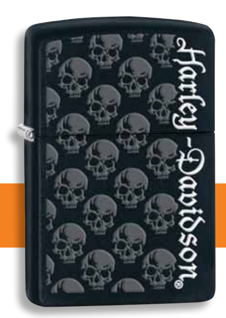
Black Matte Color Image