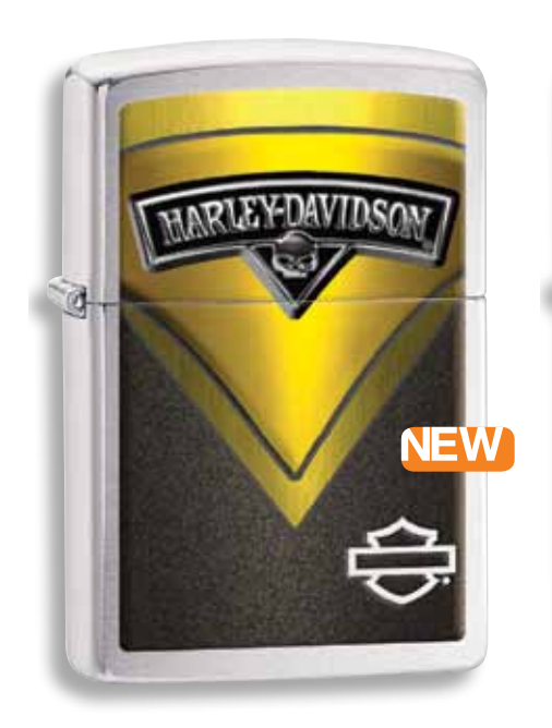
28821 Brushed Chrome Color Image